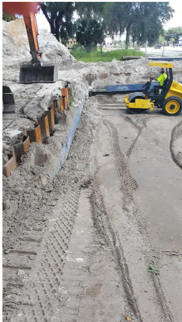
Source Removal, Moore Haven, FL

NovelE has the varied experience and expertise to streamline implementation of our environmental projects creating a “well-oiled machine” for our clientele. Our business model is based on sustainability in the products that we use, the people that we partner with and the strategies that we utilize. The key to NovelE’s success is our staff’s dedication to ethics and principles leading our clients to cost-effective solutions for their environmental needs. NovelE’s average staff technical experience is over 20 years.