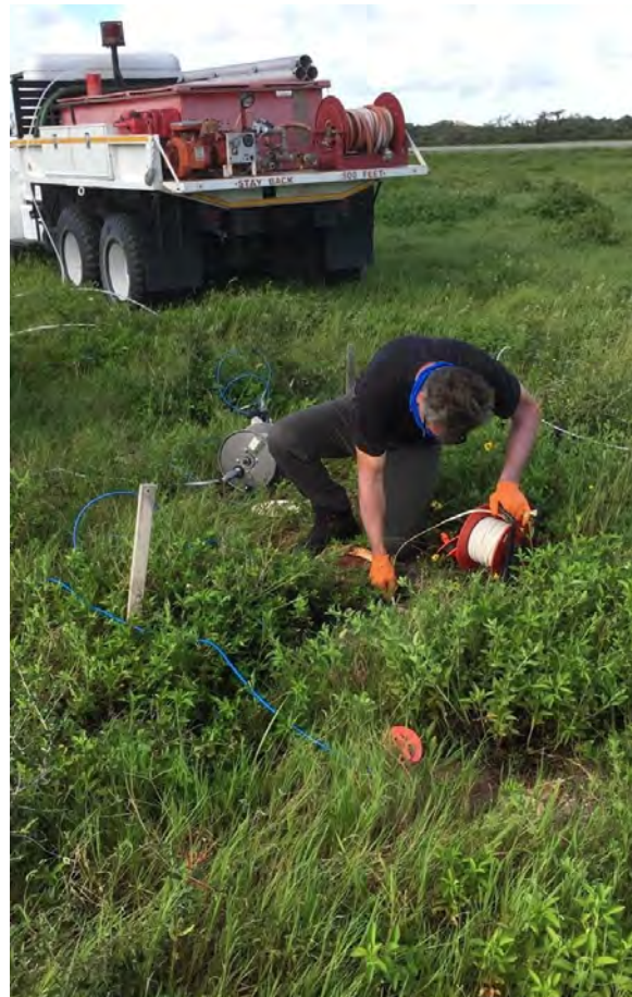
Aquifer Testing, Cape Canaveral Air Force Station, Brevard County, FL

Aquifer testing was conducted to evaluate the entire landfill complex. This data will be utilized to support an Investigation Phase Report and Optimization Plan outlining next steps for the landfill compliance.